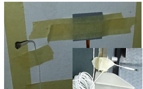
Figure 2: Above: Measurement set-up; heat flux sensor with inside temperature sensor, Bottom right: outside temperature sensor

The heat flux sensor has been attached to the inside of the wall. The inside temperature sensor is placed next to it, approximately 3-4 cm from the wall. The outside temperature sensor is also attached 3-4 cm away from the wall (and not influenced by direct sunlight).