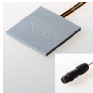
gSKIN®-XO 67 7C